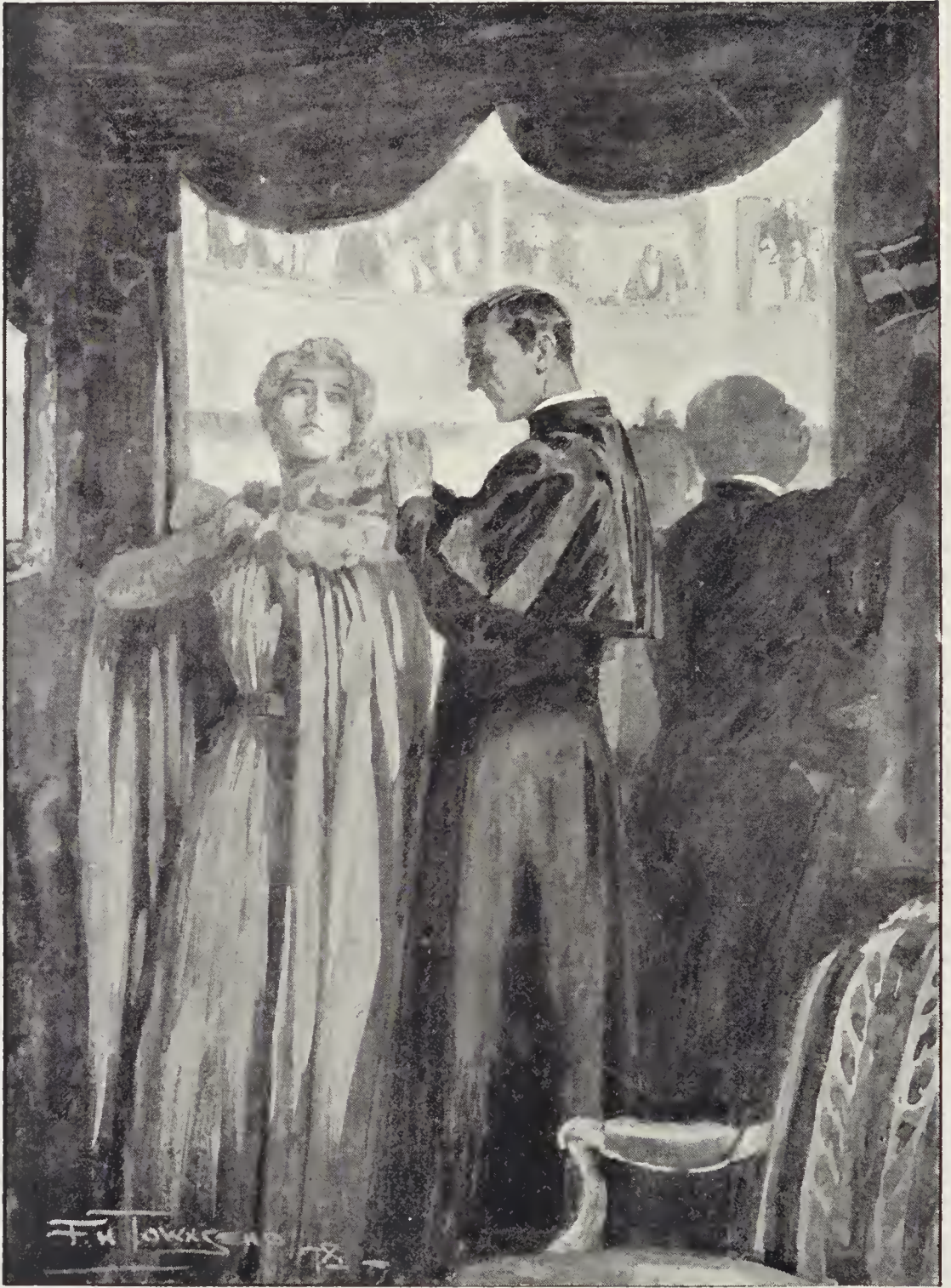
"CAN YOU NOT BE SILENT?"